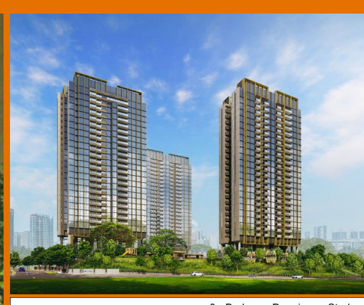
3 - Bedroom Premium + Study